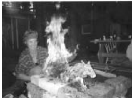
Me and my moose

I had to get moving and quickly! In earnest, I started collecting metal pieces from North Norfolk beaches which I use for mounting my ceramic pieces onto before firing. In the beginning, I made my animal sculptures in England. Then I decided simply to go to my cottage in the woods in Finland and work there. And so from May to July, that's just what I did, firing my rugged structures out in the open.