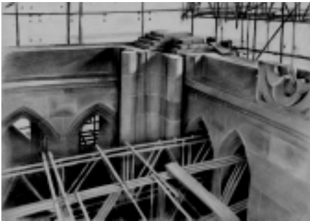
Into the tower August

My involvement with the project over the ensuing years has been most absorbing. I have been far more attracted to the ordinary, everyday details. To me scaffold boards, cables and piles of flint convey beauty and symbolism through their essential but modest role and their simple but dramatic shapes. Visiting quarries and stonemasons was like seeing where the building was born. Since one is forced to be close to the subject whose forms and lines are strong and direct, my compositions are confrontational. My site drawings are not quick sketches – I enjoy the concentration, the play of light and the contrasting textures. Back in my studio, my memories help me to distil lasting pictures in my mind.