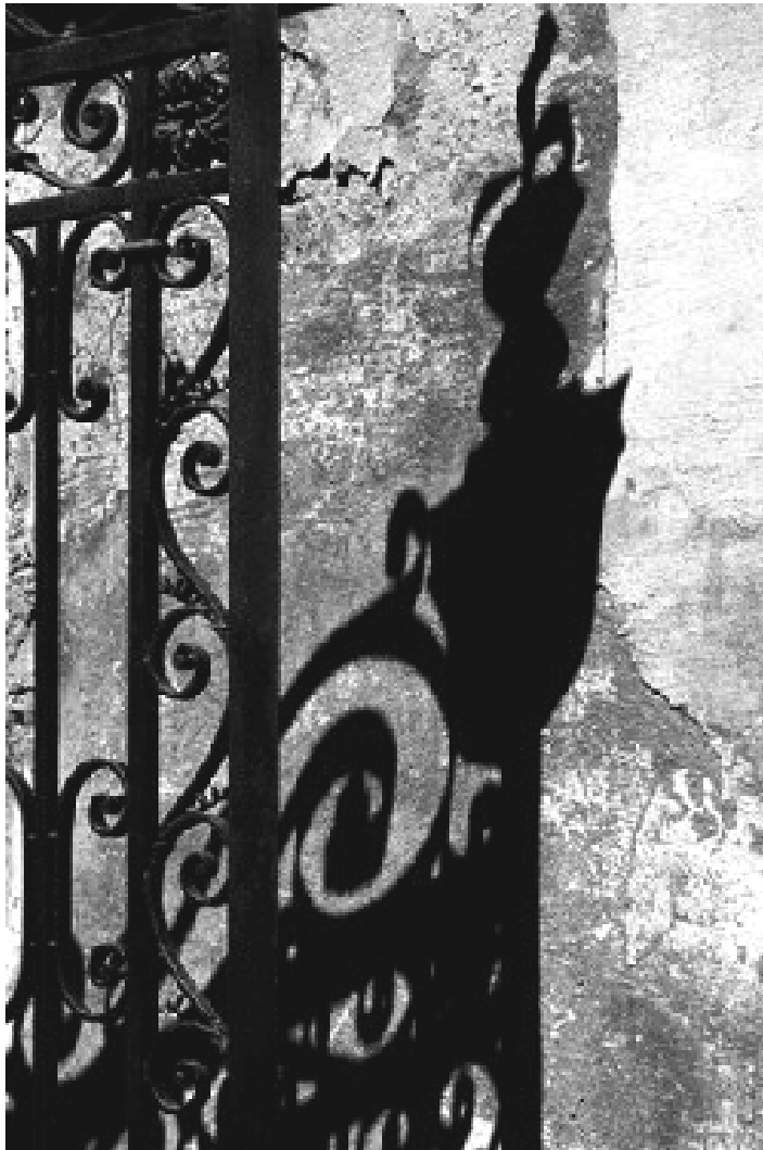
Ombra - Toscana