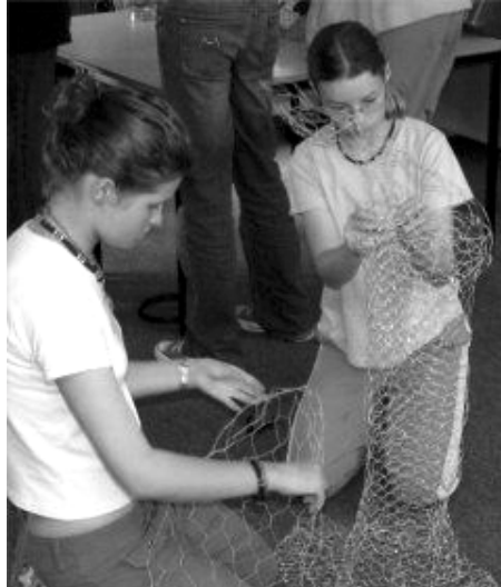
Pupils get to grips with the chicken wire